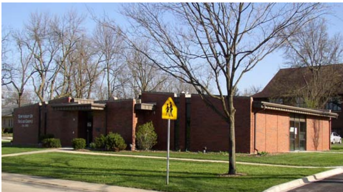
The Sugar Grove Township building at 54 Snow Street, Sugar Grove. The West Towns entrance is through the glass doors on the right.

Sugar Grove Township will be hosting an Open House at their new offices at 54 Snow Street, Sugar Grove (former Sugar Grove library) on Sunday, May 2, 2010 from 1:00 p.m. to 4:00 p.m. A ribbon cutting ceremony will be performed at 2:00 p.m. Light refreshments will be provided.